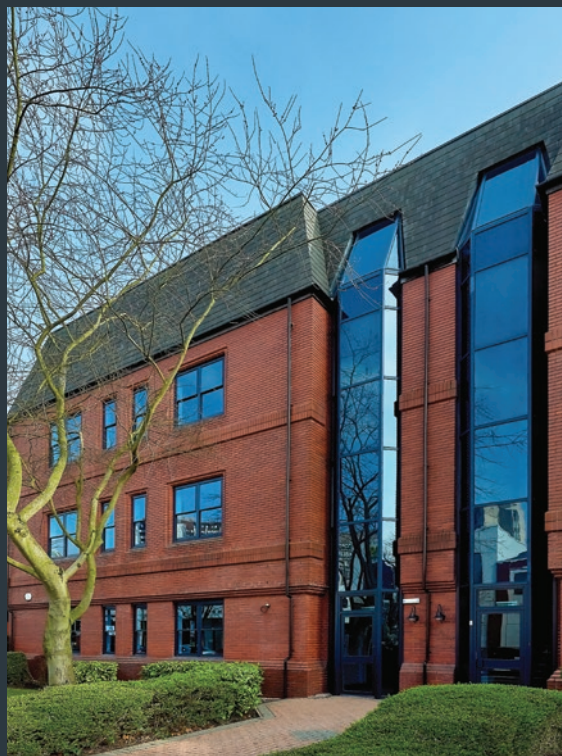
A prominent detached office building in Edgbaston